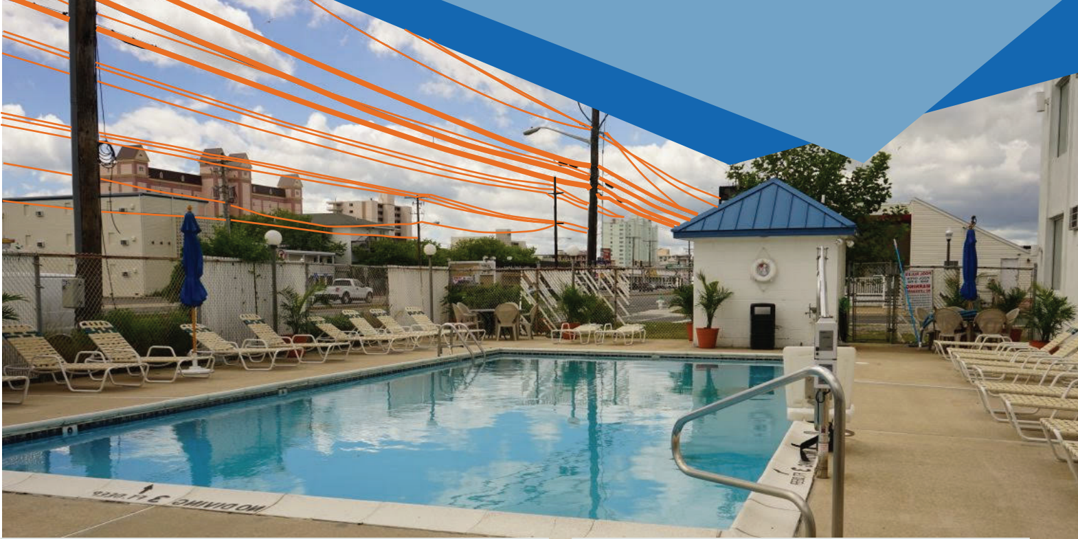
Table 1: OVERHEAD CLEARANCES